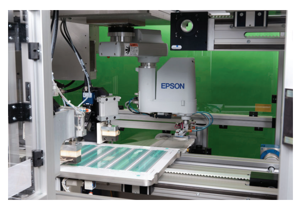
Two additional GigE cameras identify and locate the corresponding features on each lid. Sherlock vision software performs calculations and provides X, Y, and rotational correction values, which an Epson robot uses to position the lid on each coupon accordingly.