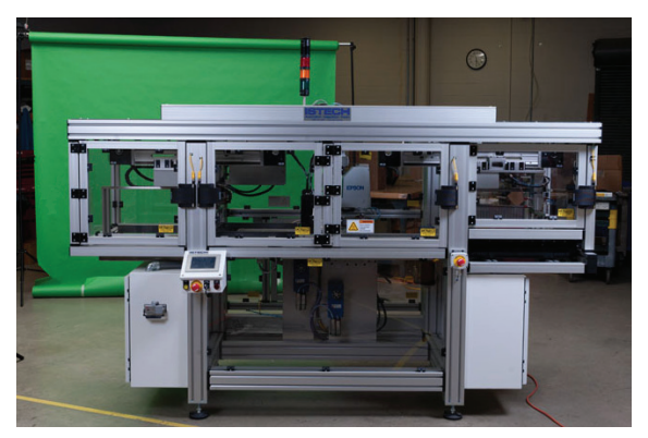
ISTECH provides turnkey custom automation solutions for a variety of industries using advanced computer and automation technologies