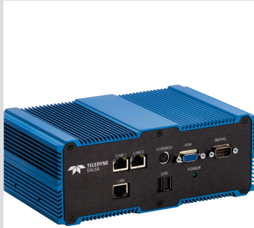
GEVA Vision System