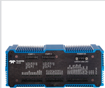
GEVA Vision System